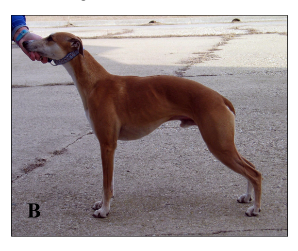
Correct front (A), side (B) and rear (C) positioning for whippet measurement